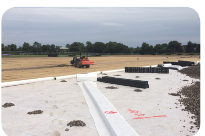
Sports Pitch Drainage