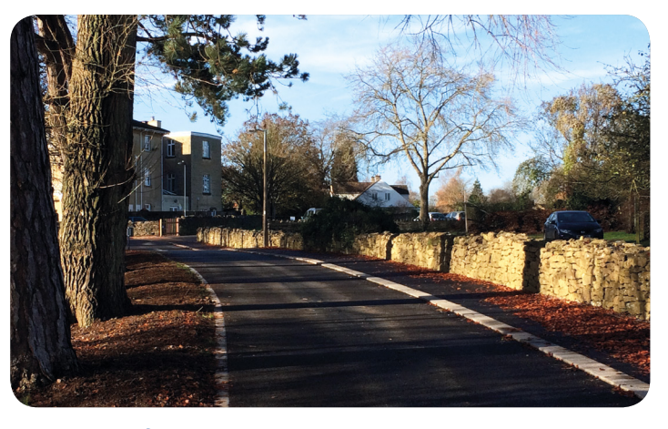
Step 4 - Surfacing

The selection of the correct stone infill is key to the performance of the system. If the correct stone is not used then the system will fail. The specification should be a 4/20 or 20/40mm stone clean angular stone in accordance with BS EN 1235. The clean stone infill allows water to infiltrate into the sub soil and allows aeration, the key components to maintaining a healthy root structure. An InfraWeb installation will always be more porous than the existing sub soils meaning the system does not change the porosity of the existing ground.