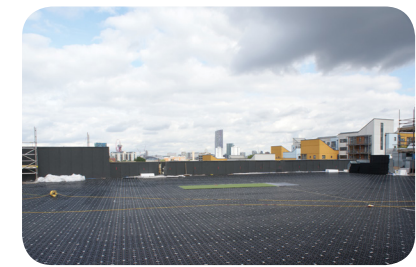
Rooftop Sports and Play areas