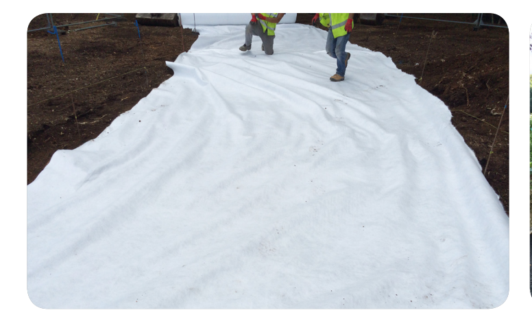
Step 1 - ArborTex

ArborTex is a non-woven geotextile specifically chosen for use with the system. The ArborTex acts as a separation and filter fabric, trapping hydrocarbons and heavy metals on the surface of the geotextile whilst allowing water to filter through to the soils below. The high puncture resistance of the ArborTex means that the clean stone infill will not penetrate the fabric.