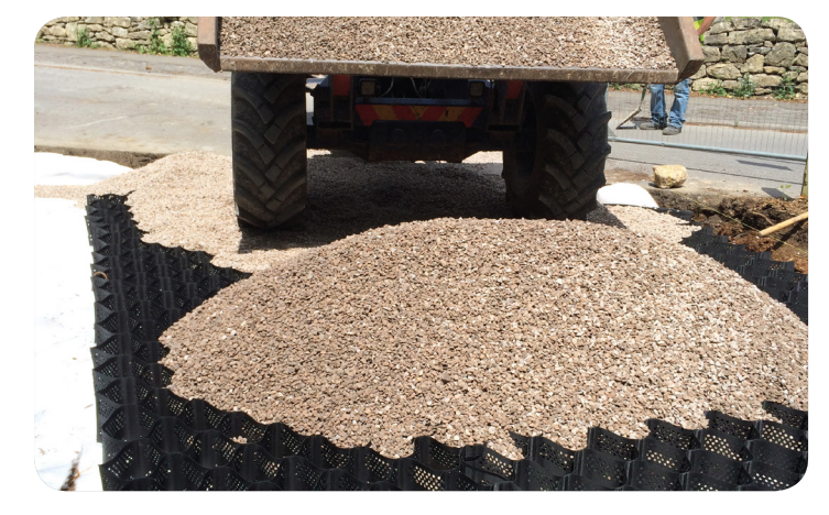
Step 3 - Granular Infill

The InfraWeb is filled with a specific grade of 4/20mm or 20/40mm granular material to allow for aeration and moisture transfer tree roots. The filled system may then be surfaced with any permeable or impermeable pavements. The system complies fully with BS5837 and APN 12.