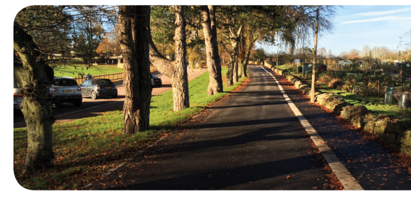
Tree Root Protection System