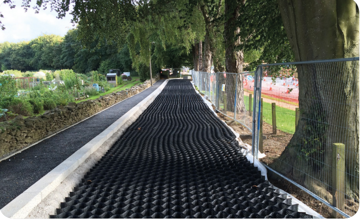
Step 2 - InfraWeb TRP

ArborTex is a non-woven geotextile specifically chosen for use with the system. The ArborTex acts as a separation and filter fabric, trapping hydrocarbons and heavy metals on the surface of the geotextile whilst allowing water to filter through to the soils below. The high puncture resistance of the ArborTex means that the clean stone infill will not penetrate the fabric.